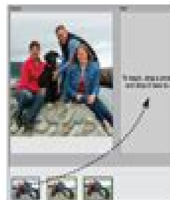
FIGURE 16-43 Drag the photo you want to use as a base into the Final pane. In this case, the expressions of the man and the girl look best in the first image, so I'm building on that one.