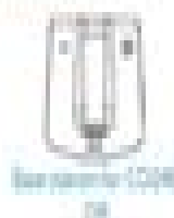
Base station for CD448 or CD449