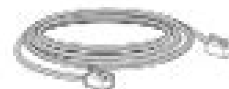
1 x Ethernet Cable