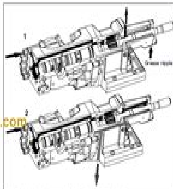
Fig. 2. Lubrication scheme: 1 Surface model, 2 L&amp;L model

The rock drill percussion mechanism and the rotation motor are lubricated by the hydraulic oil flowing through them.