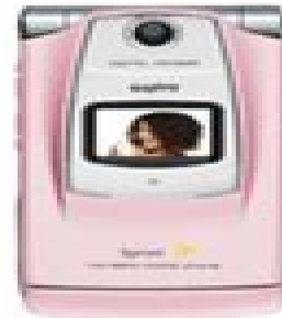
Cherry Blossom Pink