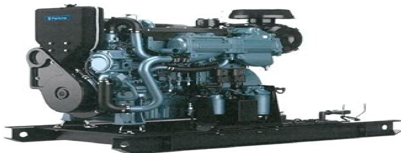
E70M Marine Auxiliary Engine