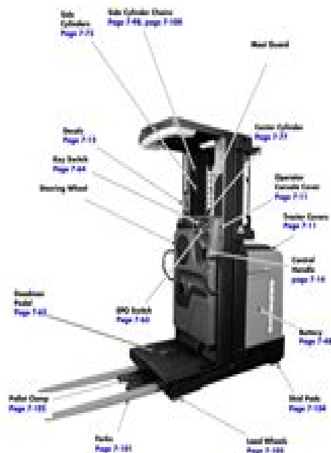
Figure F1. Forks View