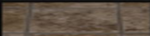
How to Replace Cracked Tile