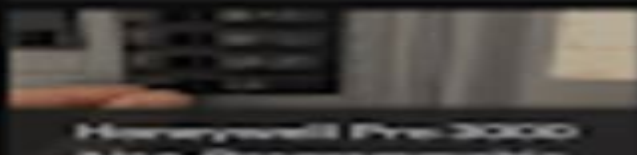
Honeywell Pro 3000 Non-Programmable Thermostat Replacement