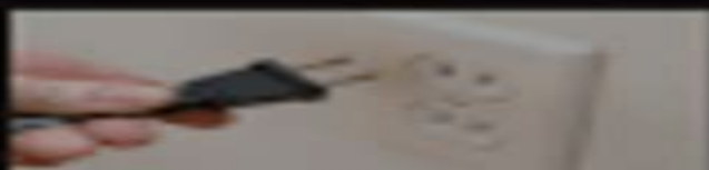
Lamp Switch Replacement