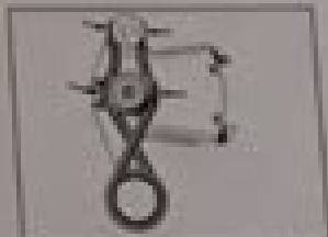
Illustration 9-17 - Contact point indicated by wire