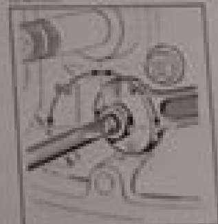
Illustration 9-18 - Gear change spring adjustment (1971 as made)