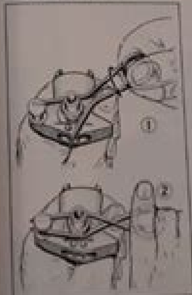
Illustration 9-16 - Fitting gear change spring

There should also be no gap in the adjustment for the spring and the cam in the spring. If you are not happy with the fit of your new spring, take it back to the vendor and compare it with the quality of pattern parts there.