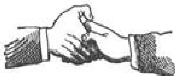
Grip of an entered apprentice