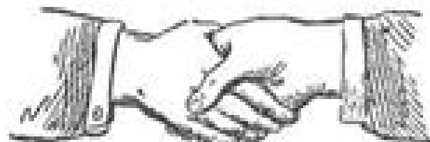
Grip of a most excellent master