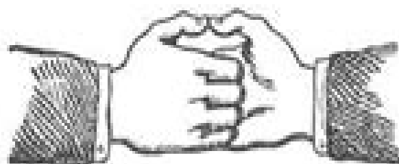
Pass-grip of a mark master mason