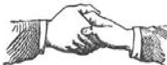
Apprentice to the pass grip of a fellow craft