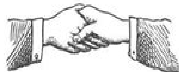
Pass grip of a master mason