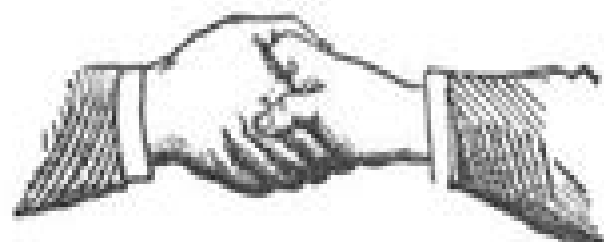
Real grip of a fellow craft