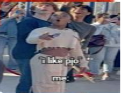
"i like pjo" me: