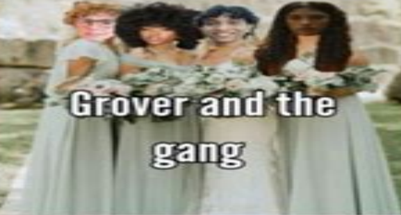
Grover and the gang