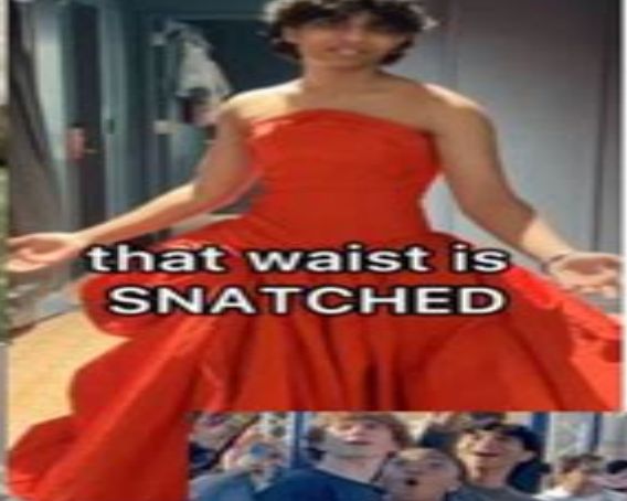
that waist is SNATCHED