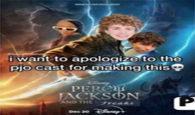
i want to apologize to the pjo cast for making this 🪦