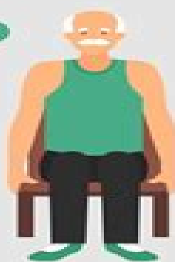
Seated Jumping Jack