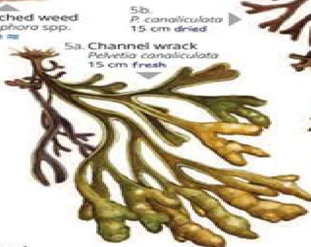
5a. Channel wrack Pelvetia canaliculata 15 cm fresh