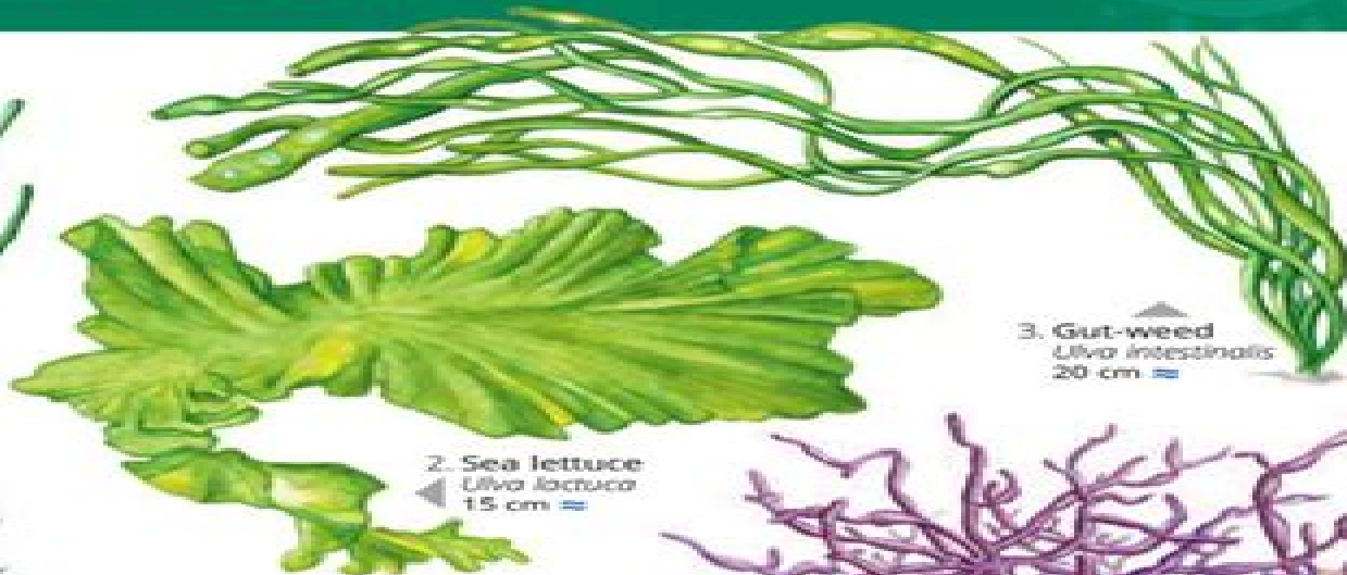
2. Sea lettuce Ulva lactuca 15 cm