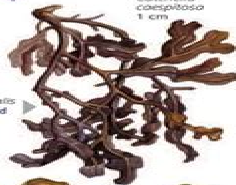
8b. Fucus spiralis 15 cm dried