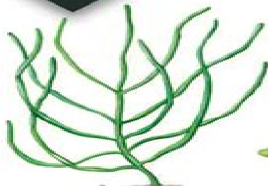
1. Thread weed Ulva compressa 20 cm