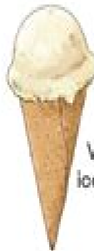
Vanilla Ice cream