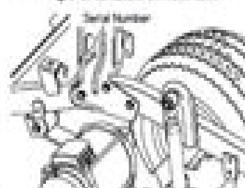
Fig. 4 Serial Number on Rear Frame