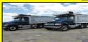
(2) 2002 Mack CV713 Tri Axle Dumps