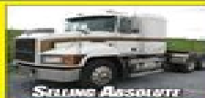
1997 Mack CH613 Sleeper