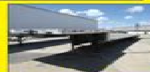
2014 Manac Trailer