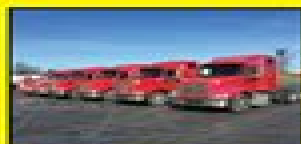
International Daycab/ Sleepers

STILL ACCEPTING CONSIGNMENTS! TURN YOUR EXCESS INVENTORY INTO CASH! ALL EQUIPMENT & TITLES MUST BE ON SITE BY 6/7/17