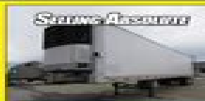
2000 Utility Reefer Trailer