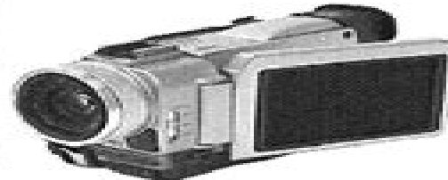
Photo : DCR-TRV20E RMT-811