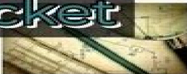
Unit 5: Semester Wrap-Up