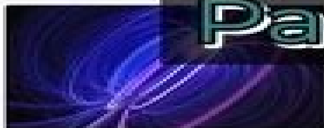
Unit 4: Electromagnets