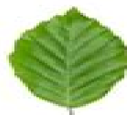
Beech Fagus sylvatica