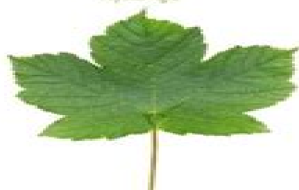
Sycamore Acer pseudoplatanus