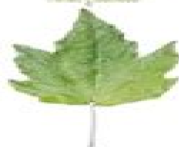
White Poplar Populus alba