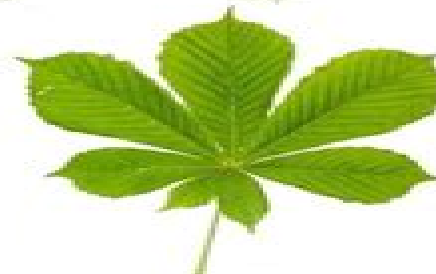
Horse Chestnut Aesculus hippocastanum