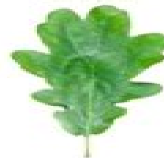
Oak Quercus sp.