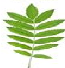
Rowan Sorbus aucuparia