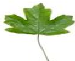
Field Maple Acer campestre