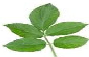
Elder Sambucus nigra