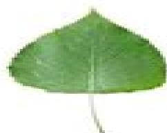
Black Poplar Populus nigra