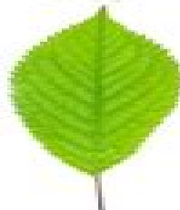
Wild Cherry Prunus avium