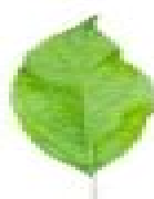
Apple Malus sp.