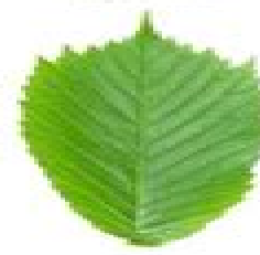
Wych Elm Ulmus glabra