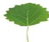
Aspen Populus tremula