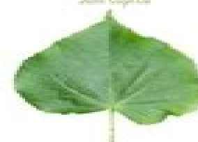
Lime Tilia sp.