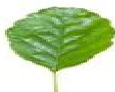
Alder Alnus glutinosa