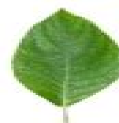
Goat Willow Salix caprea