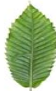
Sweet Chestnut Castanea sativa