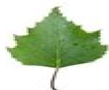
Birch Betula sp.