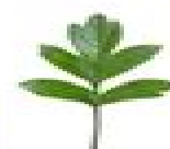
Hawthorn Crataegus sp.