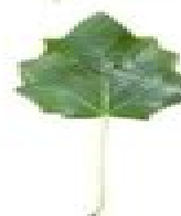
Grey Poplar Populus sp. canescens