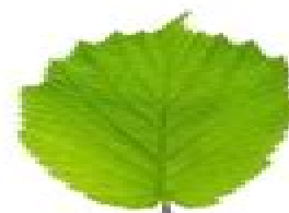
Hazel Corylus avellana