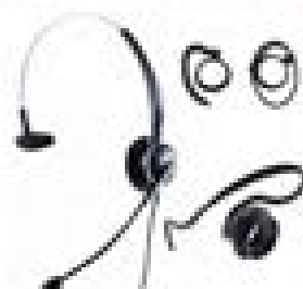
Jabra GN 2100