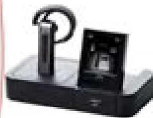
Jabra GO 6400