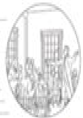
The First Continental Congress