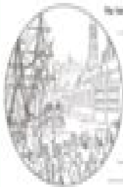
The Declaration of Independence