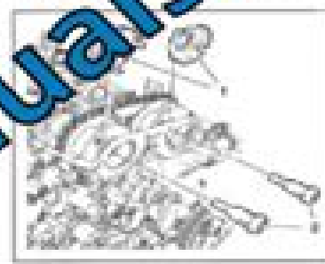
22. Install the lower support structure (2) and tighten to 80 N·m (59 ft·lb).