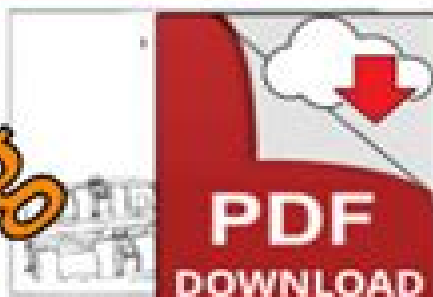
35. Install the upper support structure (15) and tighten to 80 N·m (59 ft·lb).