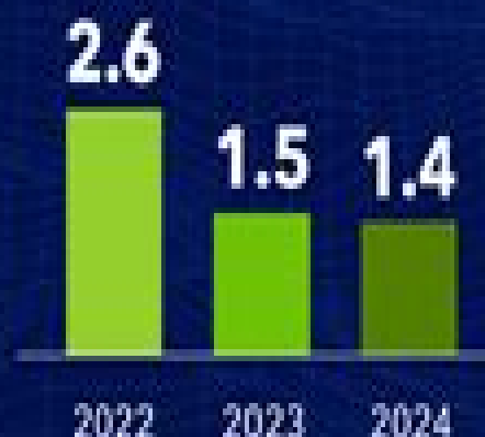
EMERGING MARKET & DEVELOPING ECONOMIES