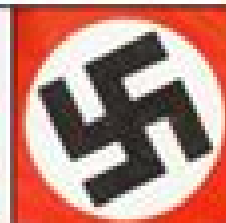
Swastika, the Nazi party symbol