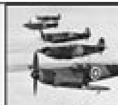
Supermarine Spitfire British fighter plane