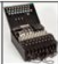
Enigma, machine used by Nazis to communicate