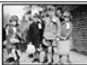
Children being evacuated out of London