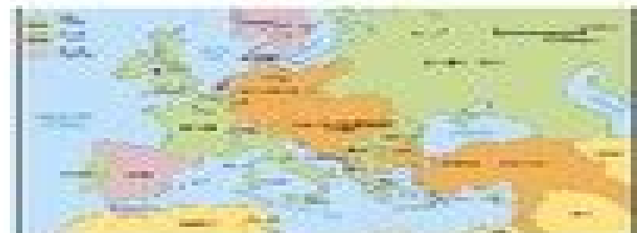
Map showing the major alliances of World War I. The Central Powers (Germany, Austria-Hungary, Ottoman Empire) are highlighted in orange. The Allied Powers (France, Britain, Russia, Italy, Japan, and the United States) are highlighted in various other colors.