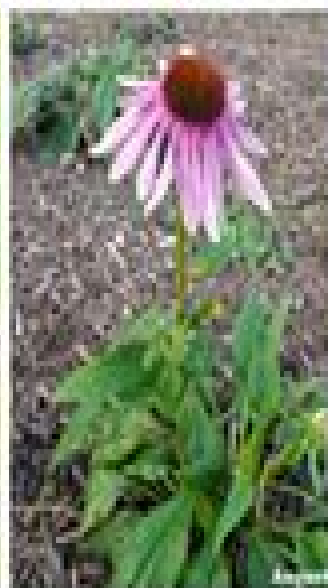
Purple Coneflower Echinacea purpurea