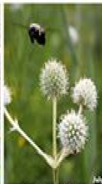
Rattlesnake Master Eryngium yuccifolium