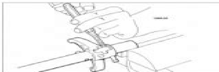
Fig. 19 - Removal of the fork retaining pin.