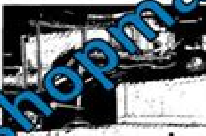
Fig. EB-13 Removing vehicle control rod

12. Remove the front engine mounting installation bolt.