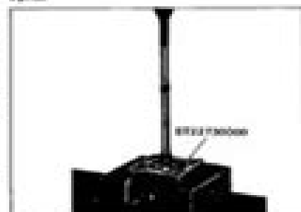
Fig. TB-29 Removing main drive bearing

18. Remove the main bearing from the main shaft by the use of a bearing puller (special tool BT-27100000) and a pin.