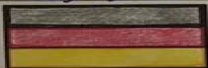
Federal Republic of Germany

In May 1949, the Soviets ended the blockade. In the fall of 1949, the Federal Republic of Germany ( West Germany ) was created with its capital at Bonn and the Soviet Union created German Democratic Republic ( East Germany ) with its capital at East Berlin .