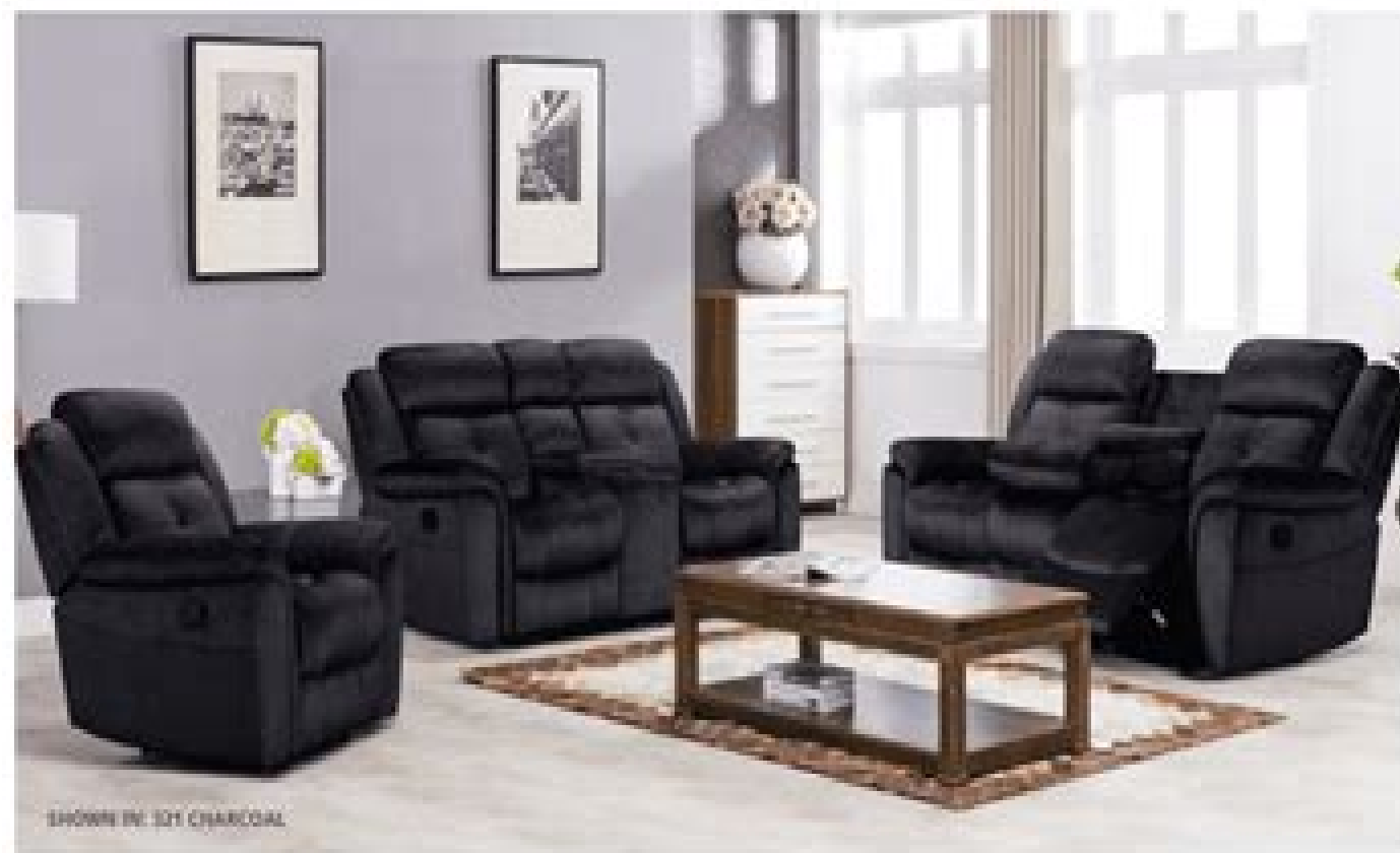
SHOWN IN: 301 CHARCOAL

Upholstered in a soft fabric, featuring a bucket style seating, you can adapt the Texas model to your homes deco.