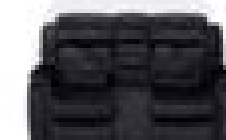
301R CONSOLE W: 60" / 150CM