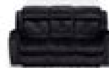
301R W: 80" / 203CM