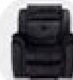
ARM CHAIR W: 36" / 91CM