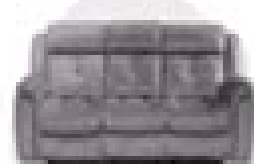
301R W: 80" / 203CM