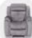
ARM CHAIR W: 36" / 91CM