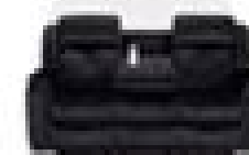
301R DROP DOWN TRAY TABLE W: 80" / 203CM