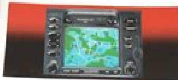
Porsche CarConnect infotainment Management (PCM)