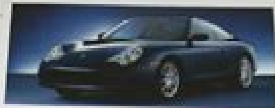
Owner's Manual Boxster