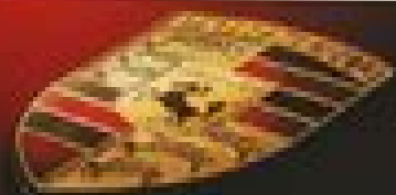
Service and Customer Information