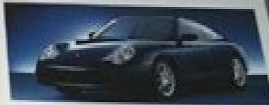
Quick Reference Guide Boxster