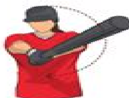
Heavy Bat Rotations 4 sets x 15 seconds

Hold a heavy bat straight out in front of body. Slowly bring barrel to forehead, then snap back to starting position.