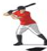
Location Soft Toss 5 minutes

Repeat, this time taking a full swing through