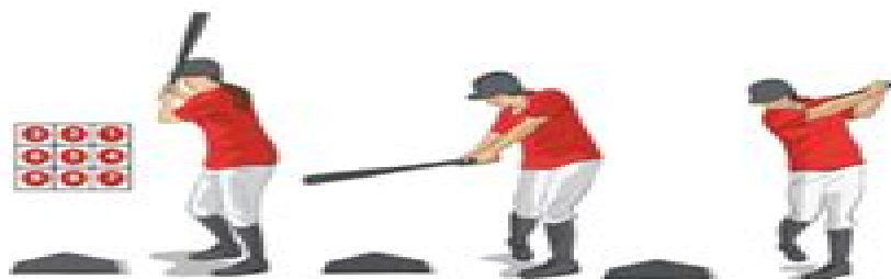
Windshield Wipers 2 sets x 9 swings

Hold a heavy bat straight out front, with barrel pointing to sky. Rotate the bat to the right like a windshield wiper, then back to top. Repeat. Switch direction each set.