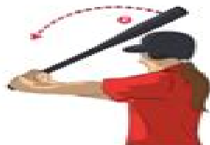
Heavy Bat Snaps 2 sets x 15 seconds

Hold a heavy bat straight out in front of body. Slowly bring barrel to forehead, then snap back to starting position.