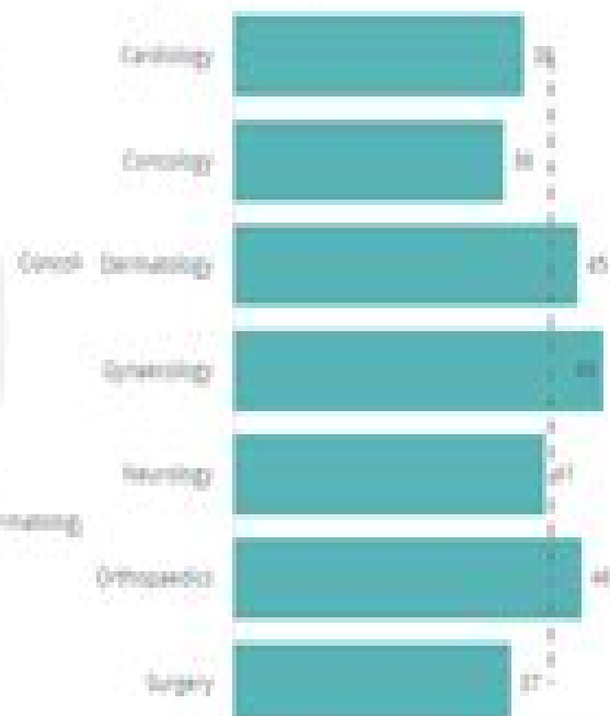
Average Wait Times by Division