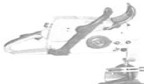
Chain saw on assembly stand

Servicing and repairs are made considerably easier if the saw is mounted on assembly stand 5910 850 3100 or 5910 890 3100. This enables the saw to be swivelled to the best position for the ongoing repair and leaves both hands free.