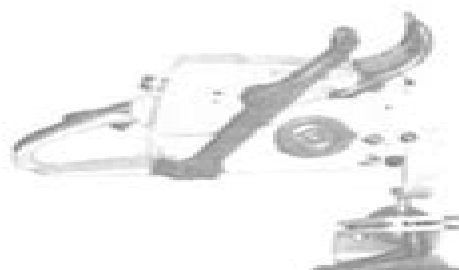
Chain saw on assembly stand

Servicing and repairs are made considerably easier if the saw is mounted on assembly stand 5910 850 3100 or 5910 890 3100. This enables the saw to be swivelled to the best position for the ongoing repair and leaves both hands free.