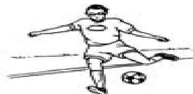
_____ deportista _____