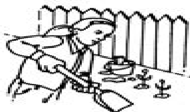
_____ trabajadora _____