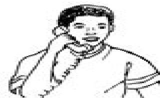
_____ sociable _____