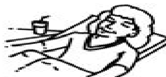
_____ perezosa _____