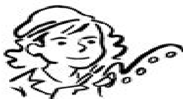
_____ artística _____

Write the Spanish vocabulary word below each picture. If there is a word or phrase, copy it in the space provided. Be sure to include the article for each noun.