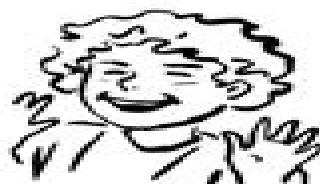
_____ graciosa _____