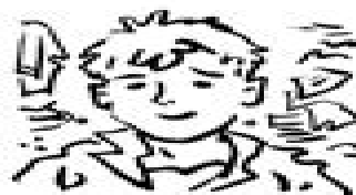
_____ desordenado _____