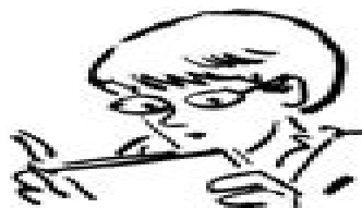
_____ estudiosa _____