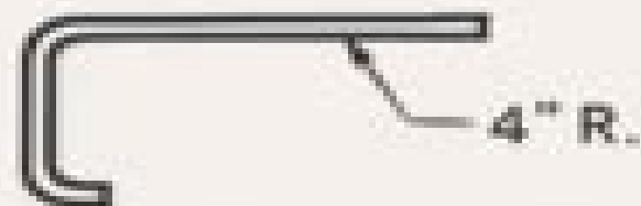
TYP. REBAR BEND