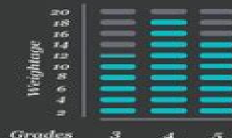
Number and Operations – Fractions (NF)