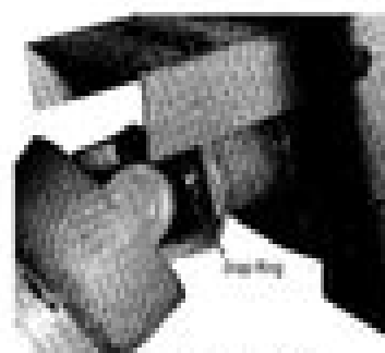
Figure 1 Snap Ring Location