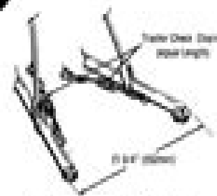
Figure 3 Tractor Check Chains