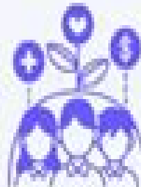
Compensation and Benefits