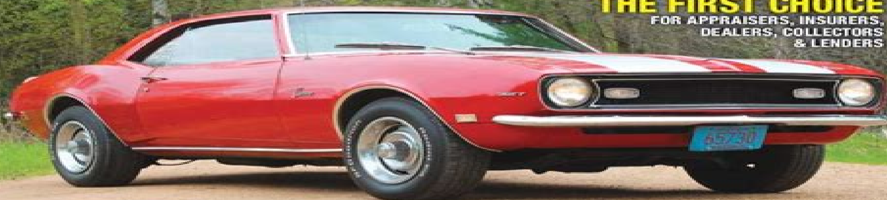
1968 CHEVROLET CAMARO

THE FIRST CHOICE FOR APPRAISERS, INSURERS, DEALERS, COLLECTORS & LENDERS