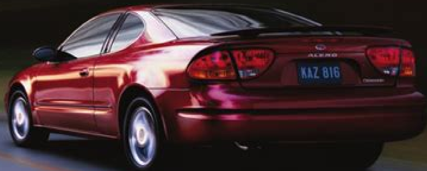
Oldsmobile Alero GLT Coupe in Sport Red.