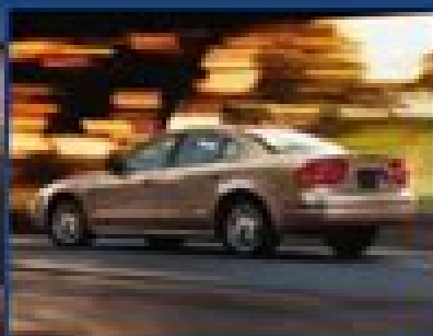
Alero GLT Sedan in Sandstone.