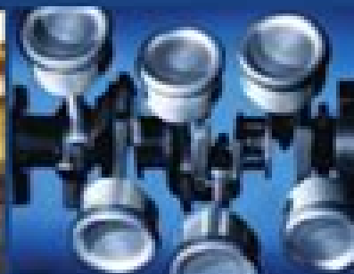
Detail of Alero 3.6L V6 engine.

The liberating Alero® brings your drive alive with an available 170-hp 3.6L V6 and standard four-wheel independent suspension. Alero adds an altogether more exhilarating dimension to everyday driving. And now, fun to drive is also easy to own. Long-life coolant and transmission fluid, and a 100,000-mile spark plug replacement* will help you save money and time while you own your Alero. Plus you have the confidence of the 5-year/100,000-mile GM Protection Plan† or you can choose additional cash in lieu of the GPP†.