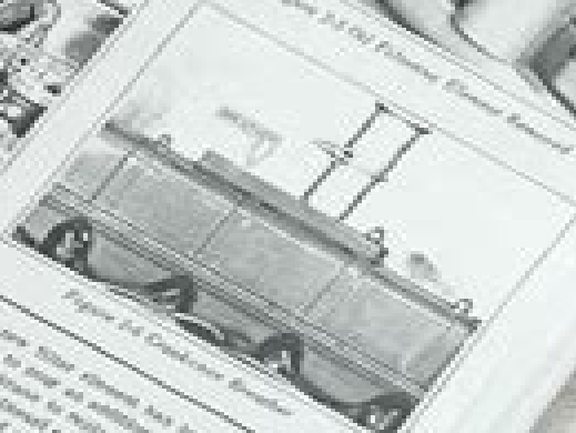
Figure 14. Crankshaft assembly.