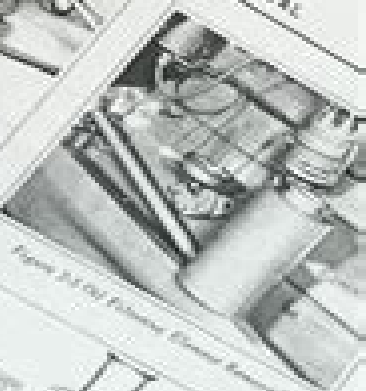
Figure 2.100: Surface of the Pallet