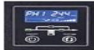
LCD display for clear information on the UPS' status and measurements