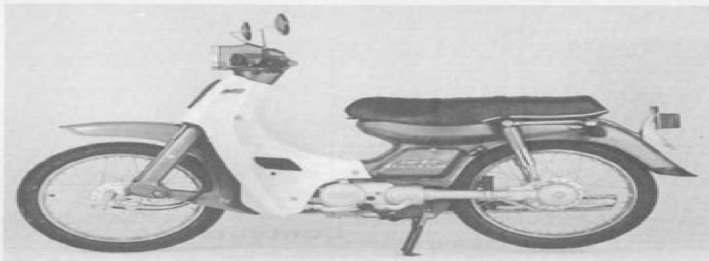
Left-hand view of the T80