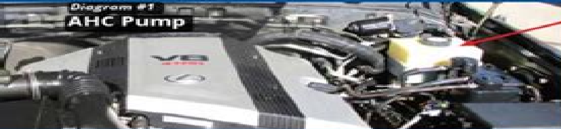
Height Control Pump Motor Fluid Pressure Sensor Fluid Temp Sensor