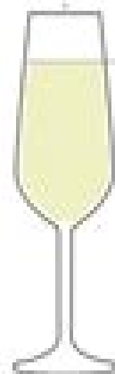
Sparkling Wine Flute