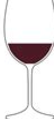
Bold Red Wine Glass