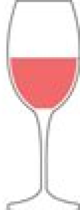
Standard Wine Glass