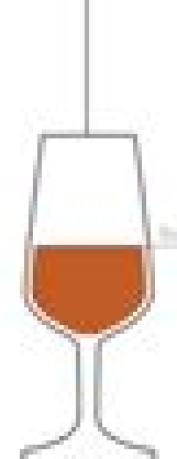
Dessert Wine Glass