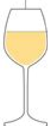
White Wine Glass