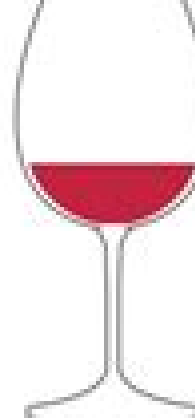
Light Red Wine Glass