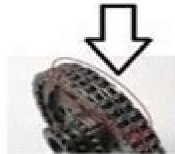
DUPLEX CHAIN & GEAR CONVERSION