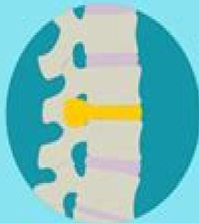
Bulging and ruptured disc