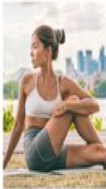
Multi-Segmental Rotation (Twist & Look Behind)