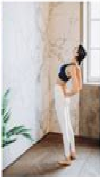
Multi-Segmental Extension (Lean Back)